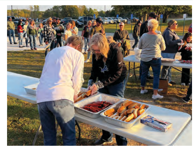
Homecoming Community Tailgate 200 free meals were served.