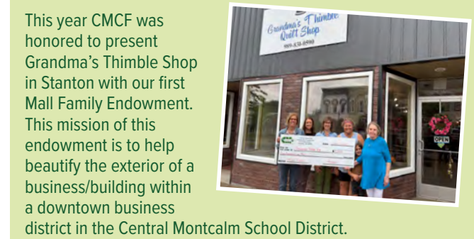
This year CMCF was honored to present Grandma's Thimble Shop in Stanton with our first Mall Family Endowment. This mission of this endowment is to help beautify the exterior of a business/building within a downtown business district in the Central Montcalm School District.

We are very appreciative of your support over this last year, and we are especially thankful to those community members who took the time to create this foundation and continue to support it today. It is because of these great people that we can continue to support the legacy they created by making a difference in the Central Montcalm Community today and for years to come.